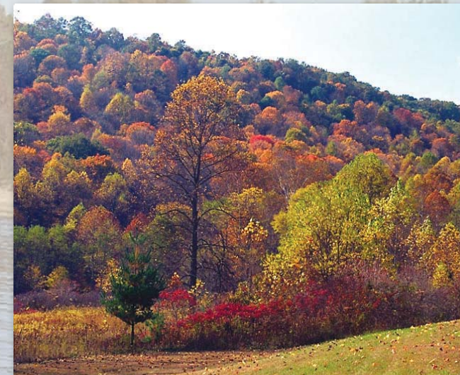
The wooded lots at Cedar Ridge Bay allow you to enjoy the beauty of the fall colors. They also give you the privacy that you desire for your weekend or retirement home.

Cedar Ridge Bay is only one minute from the Barren River State Park, and 10 minutes from Glasgow, KY with nearby access to great shopping and quality medical facilities. This area has a nearly perfect climate and temperature. It stays cool in the summer and mild in the winter. An added attraction is the low cost of living.