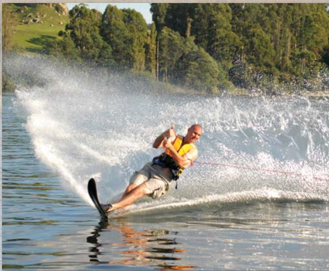
Barren River Lake is an excellent area for power boating, jet skiing, swimming and other water sports.