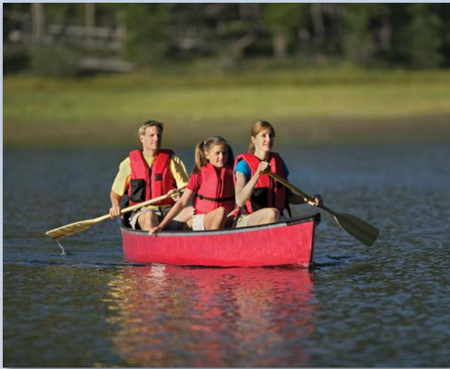
Barren River is an excellent place for float trips in canoes, or kayaks to enjoy the great outdoors.